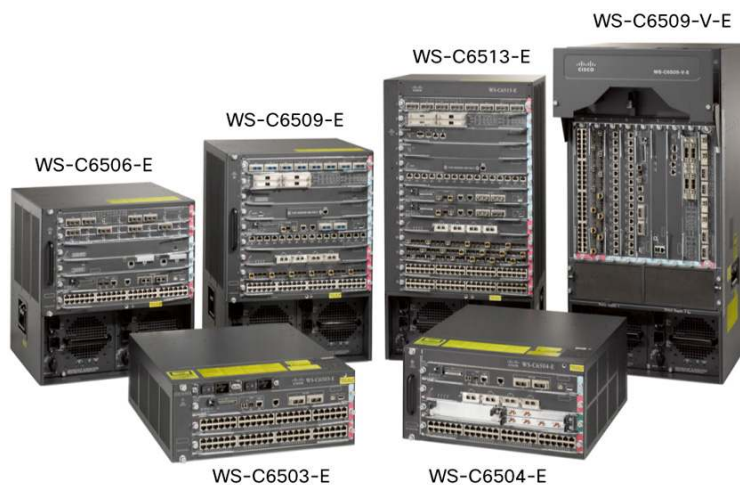
Figure 1. Cisco Catalyst 6500-E Series Chassis

The Cisco Catalyst 6500-E Series Chassis provides superior investment protection by supporting multiple generations of products in the same chassis, lowering the total cost of ownership. The Cisco Catalyst 6500-E Series Chassis (Figure 1) supports all the Cisco Catalyst 6500 Supervisor Engines up to and including the Cisco Catalyst 6500 Series Supervisor Engine 2T, and associated LAN, WAN, and services modules.